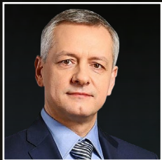
MAREK ZAGÓRSKI Polish Minister of Digital Affairs