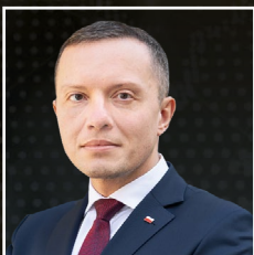
TOMASZ ZDZIKOT Secretary of State, Polish Ministry of National Defence