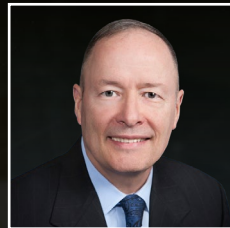
GEN (RET) KEITH ALEXANDER Former Director, NSA; Co-CEO, IronNet Cybersecurity